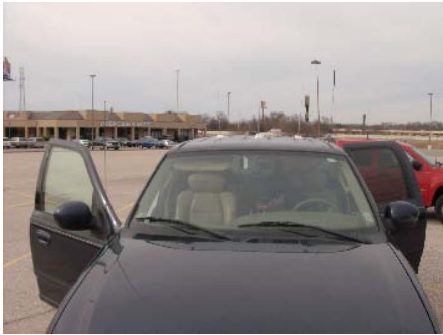
KF5CLC setting up his Doppler system for help finding the fox.