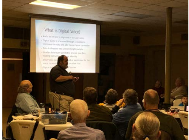
Cliff NS4B and Rick KA2BSM presenting the program about digital radio